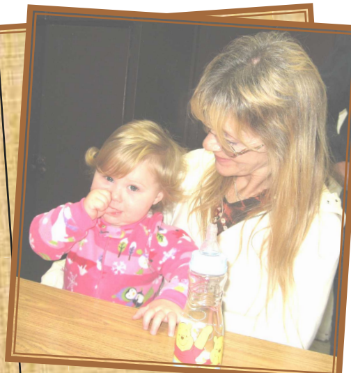
Our youngest participant

It is our passion and joy to do all we do here at the Eureka Rescue Mission. It is our sole intention to show compassion and love in hopes it will spark hope for something greater, a hope that is found in Jesus Christ. Your love in action