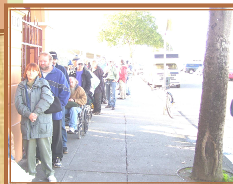
Waiting to be served

The 2008 holiday season was a great success and is now past. We want to share with you the many exciting events and opportunities that took