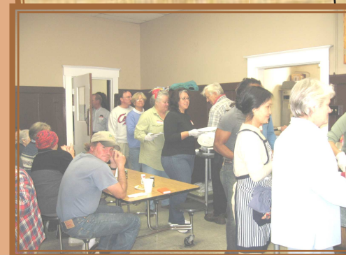
Volunteers serving the meal

helps make all this possible. Thank you for your participation, support and prayers for the ministry of the Eureka Rescue Mission. God bless you.