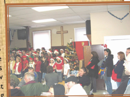
Children caroling at Christmas

place in and around the Mission. The holiday season at the Mission is an opportunity to go beyond our normal service, to