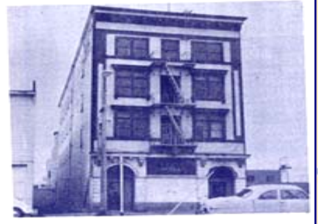
Bay Hotel 1967

PRAYER ANSWERED! LEASE SIGNED! WORK STARTED!