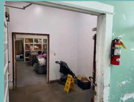
Before renovation starts