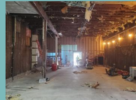
After demo on first floor