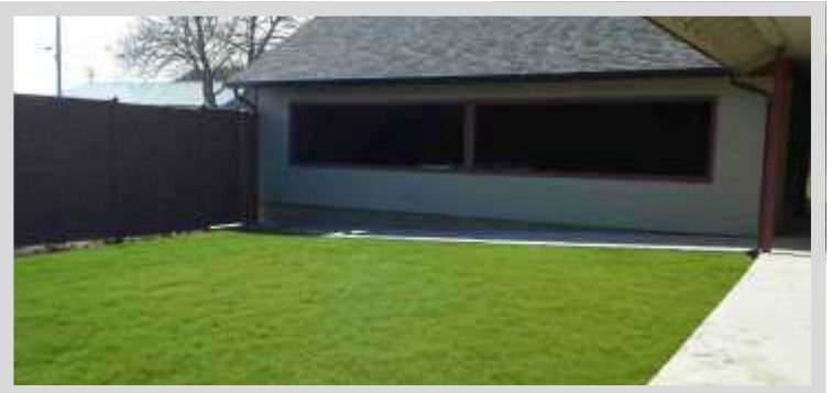
Day Use Courtyard