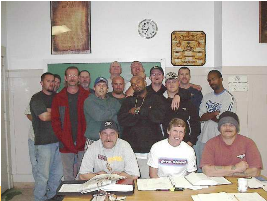
These are the men currently on the New Life Program.