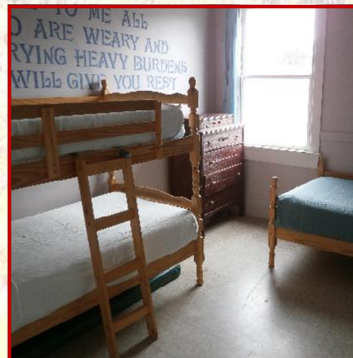
Eureka Rescue Mission Women's Shelter