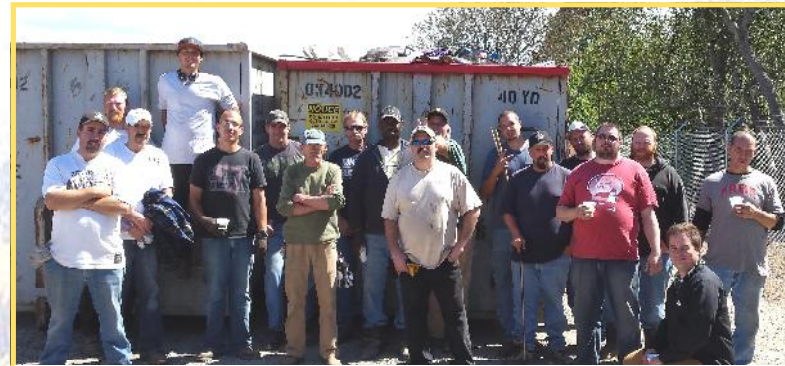
New Life Discipleship Program Men