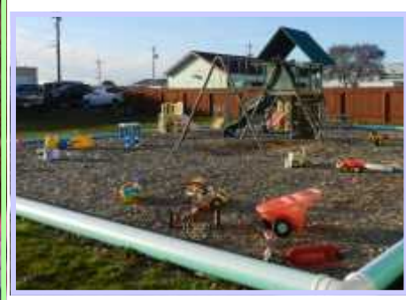
Summer is over and the playground looks a little empty during the day.