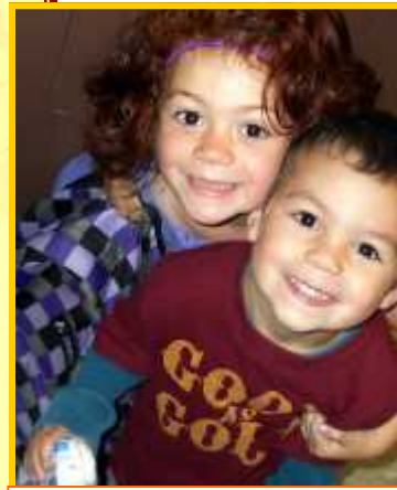
We can't wait for our first day of school.