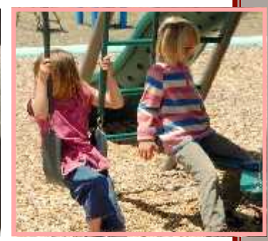
"I cant believe summer is over, can you?"