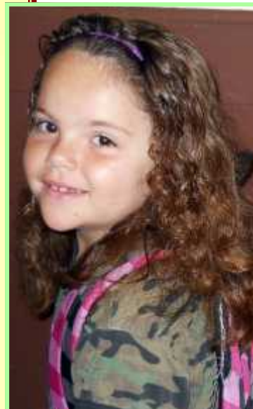
This brand new back-pack rocks!