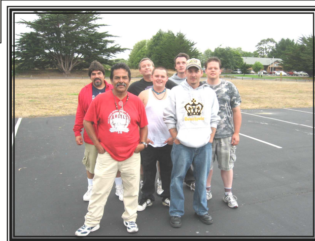
New Life Program members on recreation at Woodley Island

Graduates successfully complete over 600 hours of sound biblical teaching. They have a firm understanding of the essentials of Christianity. They have exhibited their understanding of an organized system of thought during their stay with us, and they have exhibited ethical work habits. Each of these three men has over one year of sobriety under his belt. That is new life!!