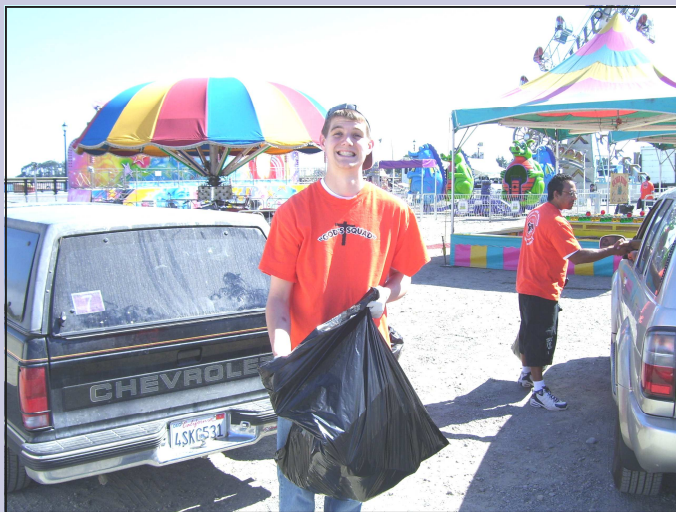
Cleanup during Main Street Fourth of July event— God Squad

Here at the Mission we are called to provide shelter, showers, food and most importantly, the sharing of the good news of the word of God which leads to relationship with Jesus. Discipleship is crucial to living our lives in Christ. Many of our frequent guests have made the yearlong commitment to the New Life Discipleship Program and are now growing in Christ, hence the Eureka Rescue Mission slogan, "Rebuilding Broken Lives One Life at a Time." This ministry is so rewarding because we see broken and empty men come in to the program, and after a short period of time we get to see a new life full of hope, joy and purpose. During the year the men on the program attend sound Bible teaching four hours per day, five days per week. Upon graduating the program, each man will have completed approximately 600 hours of Bible study, have an understanding of a sound belief system, develop an organized system of thought according to the scriptures, and hopefully will have learned to yield himself to God so that he may become a true man of God. We are witnessing men being changed as they see what God has purposed for their lives. One of many principles that we instill in the men is to be available servants for those around them. Opportunities for service arise continually, one of which is volunteer com-