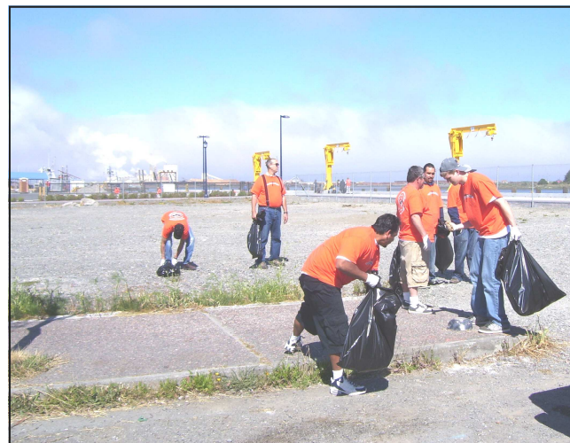
Cleaning up Old Town Eureka—God Squad

arise continually, one of which is volunteer com-