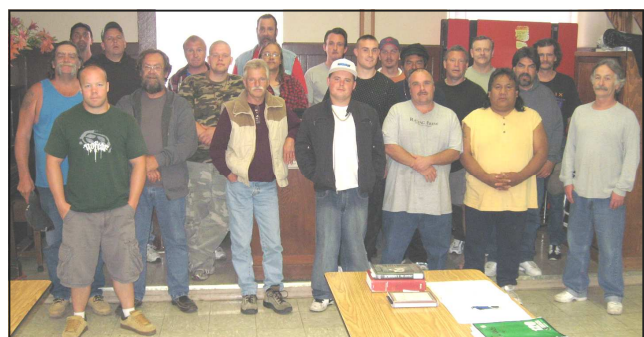
Men of the New Life Discipleship Program