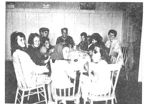
APOSTOLIC FAITH YOUNG PEOPLE WHO SPENT A SATURDAY CLEANING